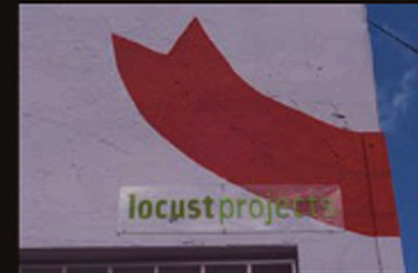
Mural Project Hand Painted Warehouse