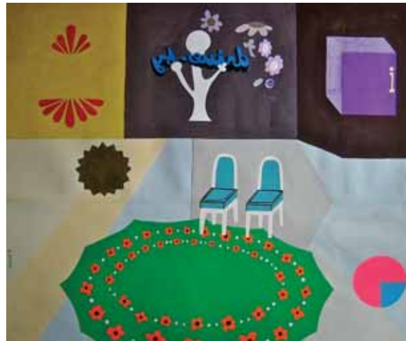
Conversation Pit , 2008, gouache on paper, 17" x 24". Collection Jamie & Stephania McClennen, New York.

The flower's open mouth, the petals looping graffiti. The peach I eat tastes like sky. I try not to step on the light bulbs which are dandelions which are eggs which are crushed aluminum cans. The geometric dove, a birdbath, an old tub. Outside my window in New York— a totem pole with a stolen shopping cart propped on top. The papier-mâché sun, a green olive sunk in my martini. One solution for Detroit— tear everything down and commence urban farming. The trellis that spells "Tillers," the curlicues in the purple dirt.