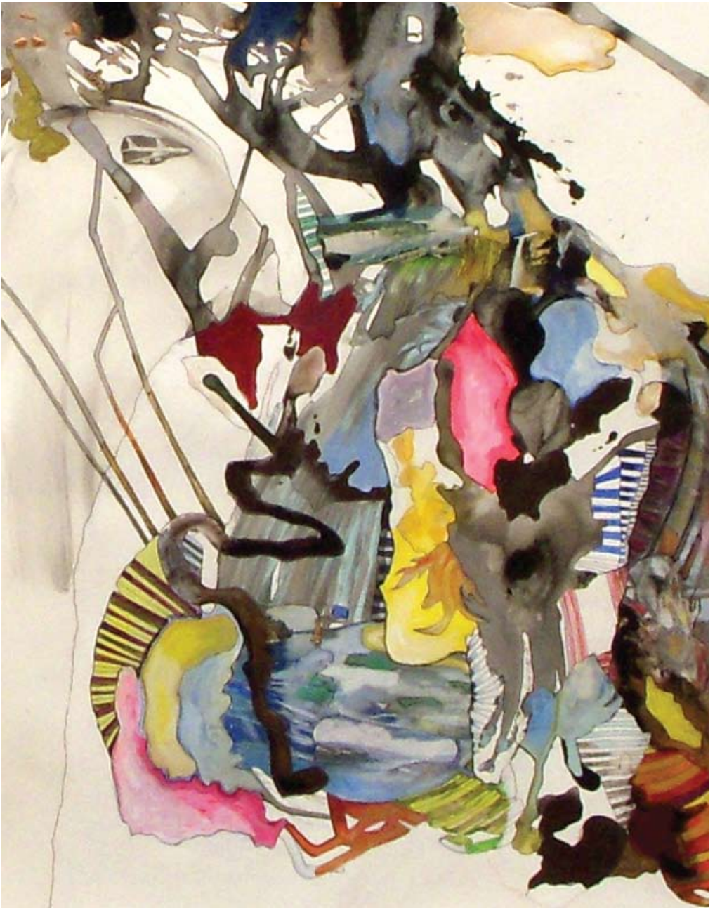
Going South (from The Twisted Landscape Series), 2009, flashe paint, glitter, ink, color pencil, collage on paper, 87" x 108" (detail)