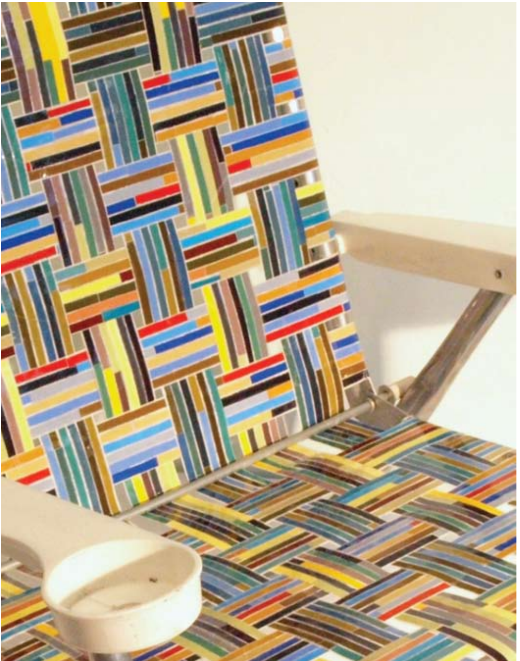
Beach Chairs (from Leisure Series), 2008-2009, folding chairs, shredded paper, 24" x 42" x 36" (detail)