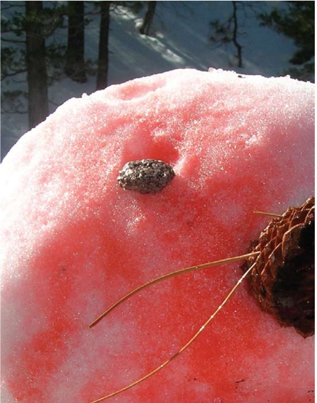
The Halobacteria Story: Pink Snowman , 2009, digital print, 16" x 20" (detail)